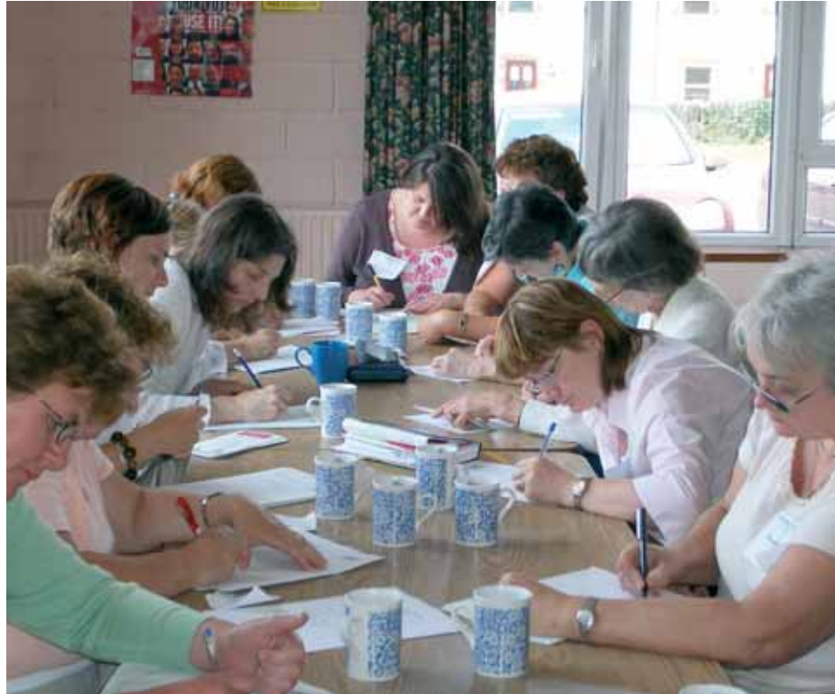
Mallow Network Members busy after a well-deserved cuppa!

The Mallow meeting was attended by network members from Cork city, Fermoy and Mallow representing many different organisations. The members appreciated meeting people from other areas and organisations. Wonderful brainstorming and discussions took place in Mallow on a Monday morning and the group gave wonderful feedback on how useful, energising and inspiring they found the meeting. It also focussed them on Election 2007 and different initiatives that can be taken in Cork city and county to encourage registration voting and political participation. Towards the end of the meeting the large group formed themselves into three smaller ones, with one group coming together to organise Voter registration in the Mahon, Togher and Ballyphehane areas of Cork City, another group focussing on Mallow and a third on Fermoy. All three areas will hold Voter Registration drives in the autumn.