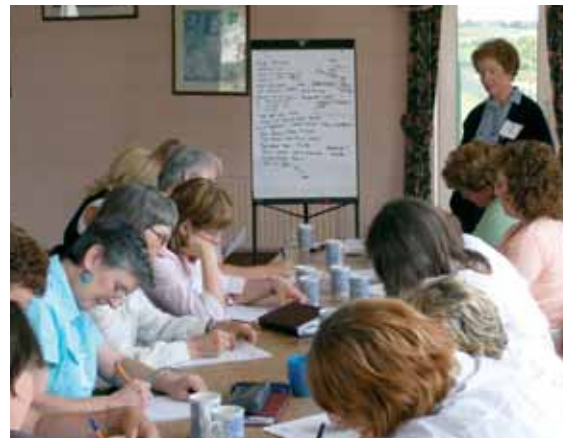
Members hard at work at our Mallow Network meeting - June 2006