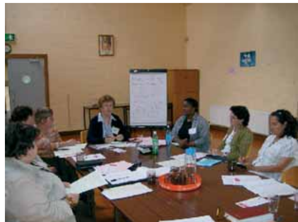
Tralee Network Meeting - June 2006

Our first meeting was attended by members from all over Kerry from urban Tralee to the more rural Caherciveen. Different ideas were put forward regarding Voter registration. One of these ideas was incorporating into computer classes, the E-Reg facility now available on most local authority websites. The E-Reg allows everyone to check if they are on the electoral register by keying in their name and address. A table with information and forms would then be available in each centre to encourage and make it easy for people to register. Another idea was to incorporate the registration form into literacy classes as an example of form filling.